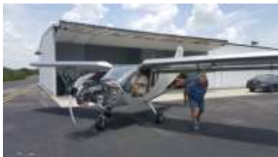
Art Coll & Mike Degeorgio Zenith CH 750

The following pictures are to provide an idea of what the completed plane may look like by our builders. If we get some new pictures we can update the newsletter on where the builders are at in the process.