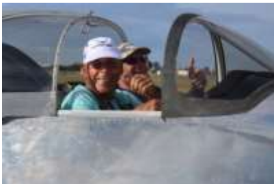
After a successful 45 minutes of flight (note the drink in hand)