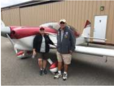
Cold day in LaBelle – Riches 2 nd RV and a real performer.