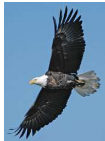
Young Eagle Updates

We would like to know what type of airplane you have and share with the rest of the members. Pictures are great! Please send info to the following email address: eaachapter66@gmail.com